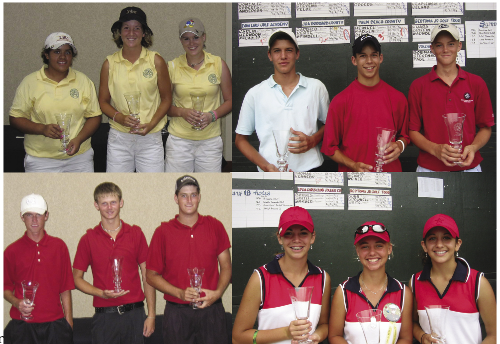
(L-R) Greater Sarasota Jr Golf Assoc., Volusia Flagler Jr Golf Assoc., Don Law Golf Academy, St. Lucie County Jr. Golf Assoc.

In this 36-hole stroke play competition the total of the low two of the three gross scores count for each round. This event is open to junior programs that provide organized tournaments, instruction or clinics which are open to all junior golfers in the community.